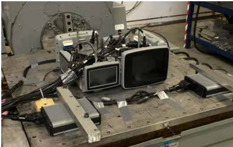
| Mechanical Loads Testing ISO 16750-3