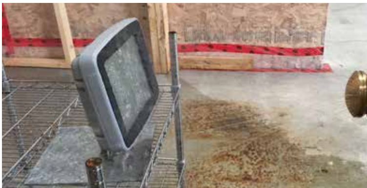
| Water Ingress, ISO 20653

Electronics Test Centre is capable of performing Mechanical, Environmental and EMC testing for most of the Automotive Standards in one location. We have extensive experience in a wide range of testing as per ISO, IEC and Automotive Manufacturers' standards.