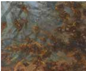
| Corrosion Test Sample