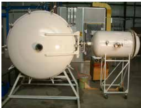
| Altitude Chamber