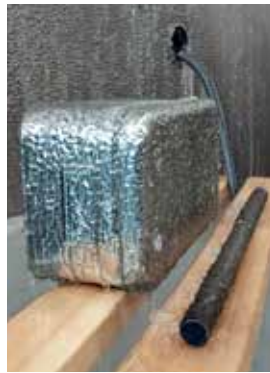
| Ice Test