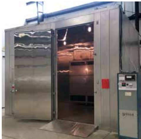
| Walk-in Environmental Testing Chamber