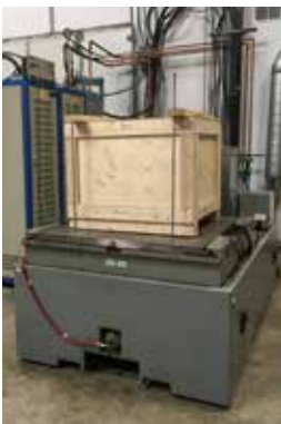
| Vibration Table