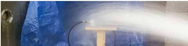
| Salt Water Simulation Testing