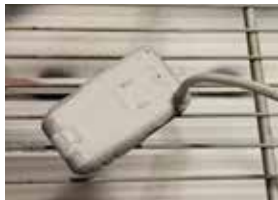
| Dust Ingress Testing